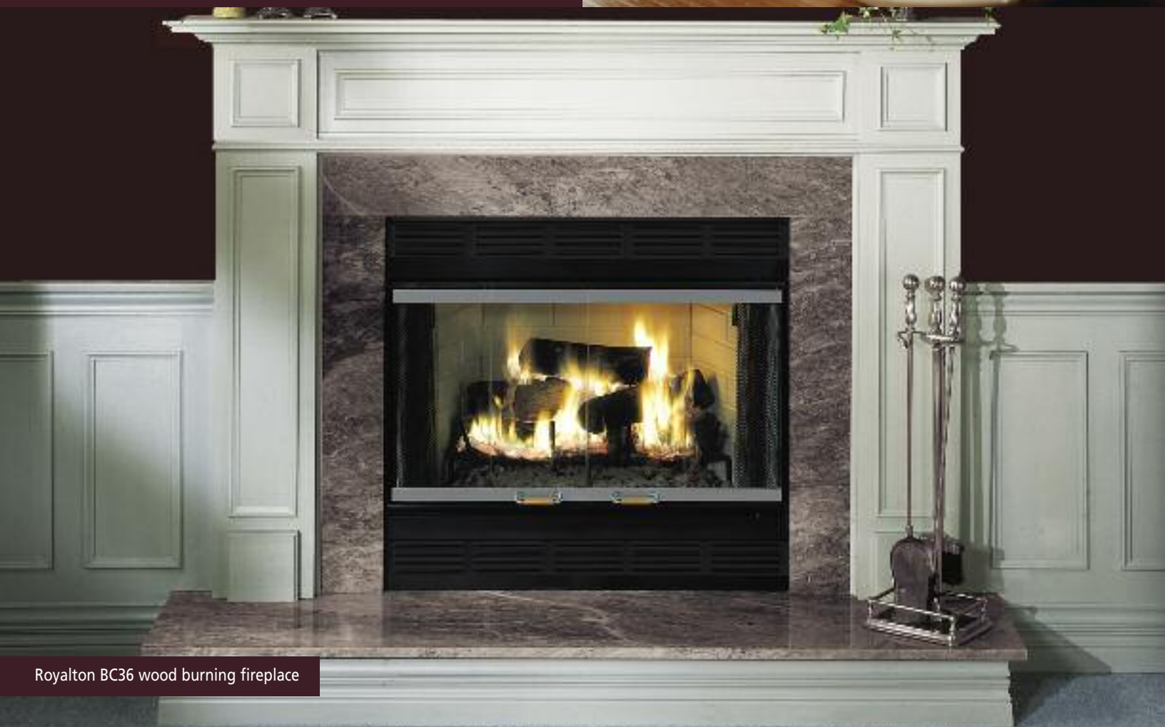
Royalton BC36 wood burning fireplace