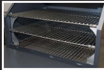
3 Layer Grilling