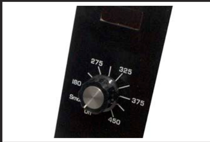
Digital Temperature Control